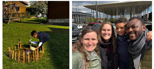
Byebye Kassel April 2025