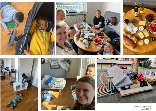
Umzug / Moving April 2025