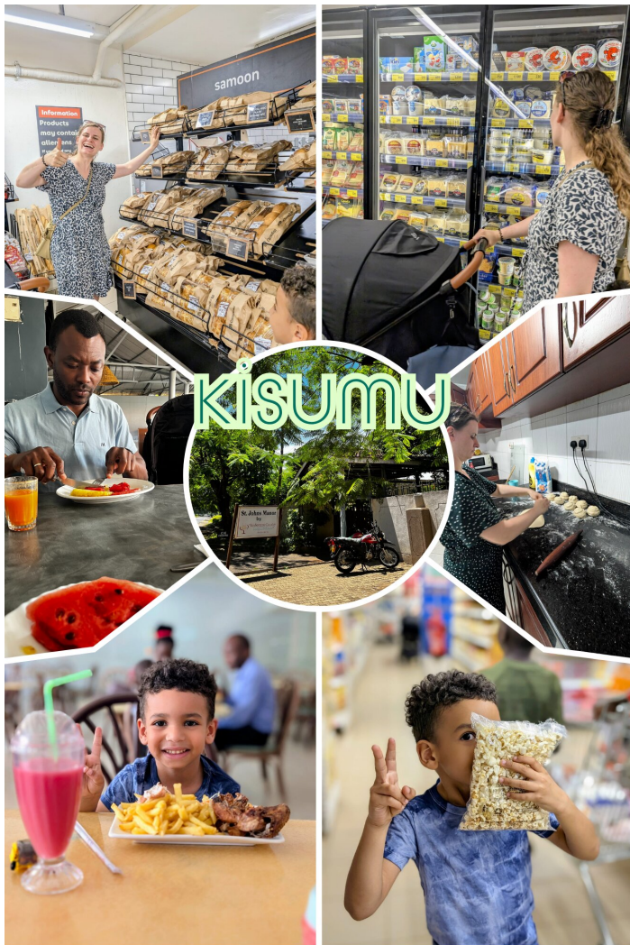
Our first days in Kisumu

The first impression combines delicious food, warm temperatures and friendly encounters with mosquito bites and tiredness.