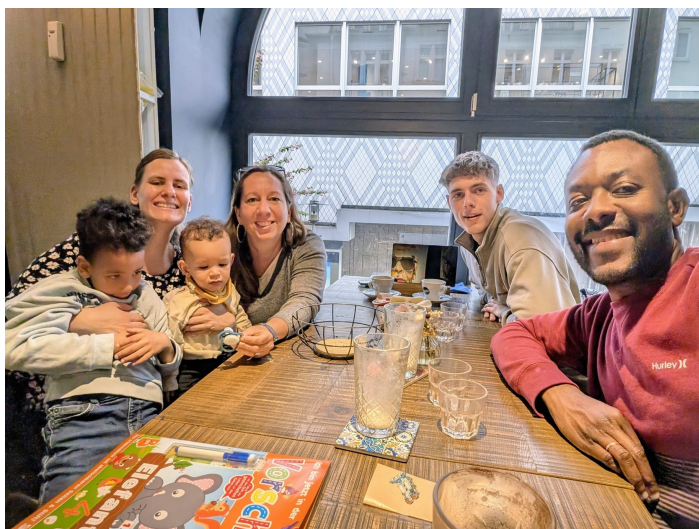
Last gatherings before the departure

Shortly before Easter, we went to Kassel to “wind down” before the big trip. Between friends and family, we packed our suitcases: seven large and three small ones.