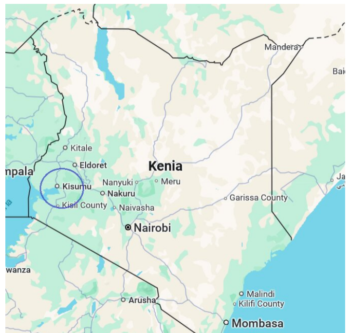
Kisumu in Kenya

Kisumu is only 24 kilometres away from the equator and usually has warm temperatures throughout the year.