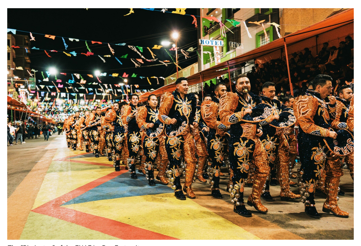
The "Pimientas" of the ENAF La Paz Fraternity.

The Oruro Carnival took place at 3735 meters (12254 feet) above sea level at the beginning of March. Its cultural richness and popularity have made it one of the most important carnival festivals in the world alongside the carnivals of Brazil and Colombia. Every year, the carnival attracts around 400,000 visitors and has an estimated economic impact of 125 million Bolivianos. More than 28,000 dancers and 10,000 musicians in around 50 groups (organized in 18 different dances) take part in the parade and dance for twenty hours without interruption along the four-kilometre-long procession. Every Saturday, the procession is a pilgrimage to the El Socavón sanctuary; people enter the church on their knees and promise the Virgin that they will dance for her for a total of three years in return for her fulfilling a wish. In 2001, UNESCO declared the Oruro Carnival a "Masterpiece of the Oral and Intangible Heritage of Humanity" (UNESCO, Wikipedia). This time I wasn't just there as a spectator, but as a Caporal Macha dancer.